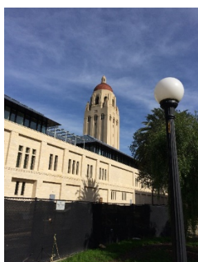
Figure 1. Picture taken near Hoover Tower.

Finally, I appreciate the readers reaching the last paragraph. At the same time, I would like to thank to people who prepare and support my dispatch in SLAC National Accelerator Laboratory and Osaka University.