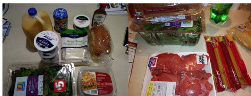
Figure3, Items bought in a supermarket.