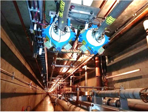
Figure 3: Picture of a part of LCLS-I.